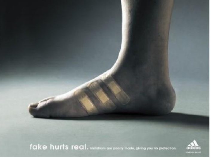
Figure 2. The advertisement of Adidas Cultural References and Context:

that the advertisement of the most famous sport shoes company Adidas. By presenting hurt foot it is understood that their product is the best and real<sup>4</sup>.