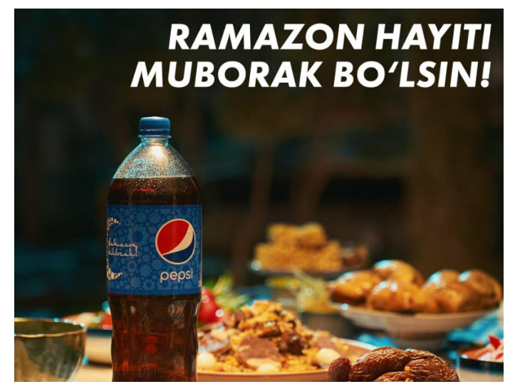
Figure 3. The advertisement of Pepsi.

Incorporating culturally relevant references and context into advertising texts is a powerful strategy. Ads that resonate with the audience's cultural experiences, traditions, and values are more likely to capture attention and foster a positive response. Besides that, using cultural references arise trust to particular product. This requires a deep understanding of the target audience's cultural background and preferences.