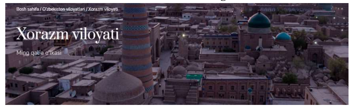
"The city of thousand castles"