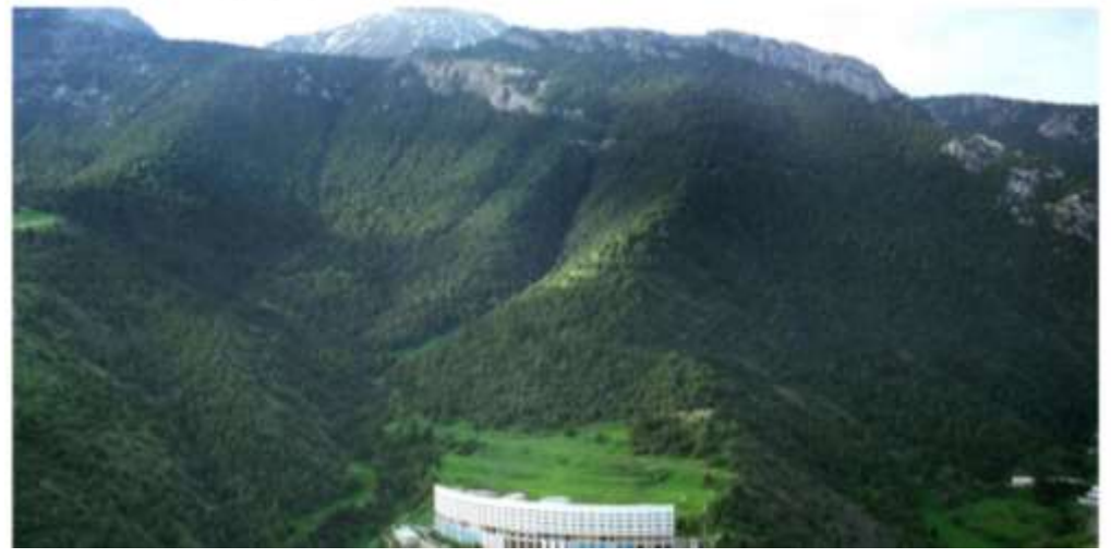
"Zomin - Uzbek Switzerland"

Ajoyib landshaftlar va toza togʻ havosi, flora va faunaning xilma-xilligi, qadimiy ziyoratgohlar va noyob milliy sihatgoh - bularning barchasi Zomin.